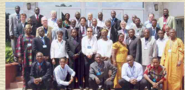
↳ Launch of 7Up4 Project in Accra, Ghana, on June 19-20, 2008