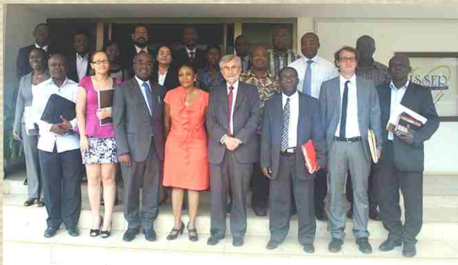
↳ Participants at the NRG meeting of CREW Project in Accra, Ghana on August 06, 2013