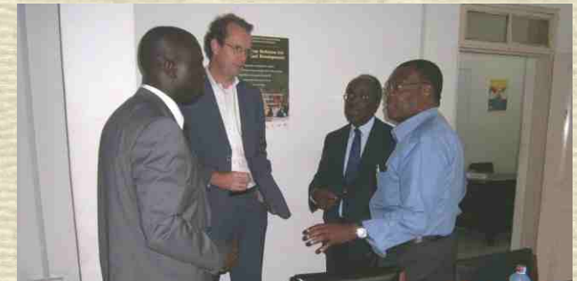
↳ Roundtable discussion on World Competition Day on December 04, 2013